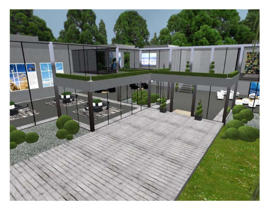
Figure 1. Screenshot of virtualBrunel campus space in SecondLife.

Dr Olinkha Gustafson-Pearce of the Design Department produced within the virtualBrunel space of SecondLife , a full campus replica of the University buildings as shown in Figure 1. Under this pilot scheme, Dr. Gustafson-Pearce created a specific area for the fictitious company, Brunel Environmental Engineering Ltd., with a complete set of offices, drawing rooms, meeting rooms and furniture in which participants could hold a virtual meeting shown in Figures 2 and 3. This area within SecondLife was set up to be accessible only to invited participants. During the pre-scheme briefing meeting, volunteer interns were introduced to SecondLife and virtualBrunel , and given access to a secure area within it as an office facility that had been created by Brunel University's Design Department. Each of the volunteer interns was provided with a copy of Brunel University's Conditions and Guidelines for using SecondLife in a safe and acceptable manner. In order to access this virtual world in SecondLife , participants needed a lap-top or desk-top based computer with a reasonable specification graphics card, an internet access point and a microphone and speaker headset.