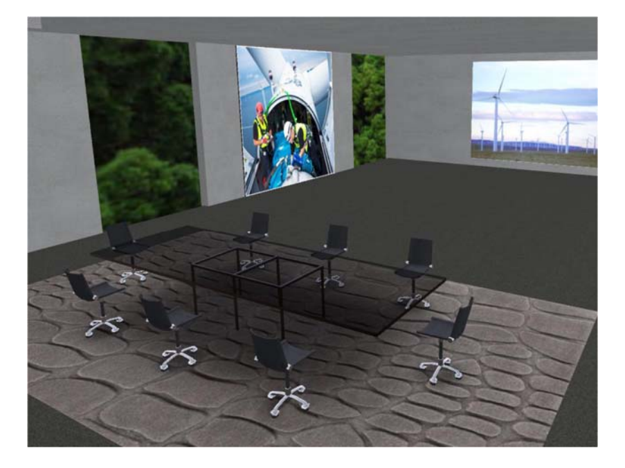
Figure 2. Screenshot of virtualBrunel meeting space created under the pilot scheme.