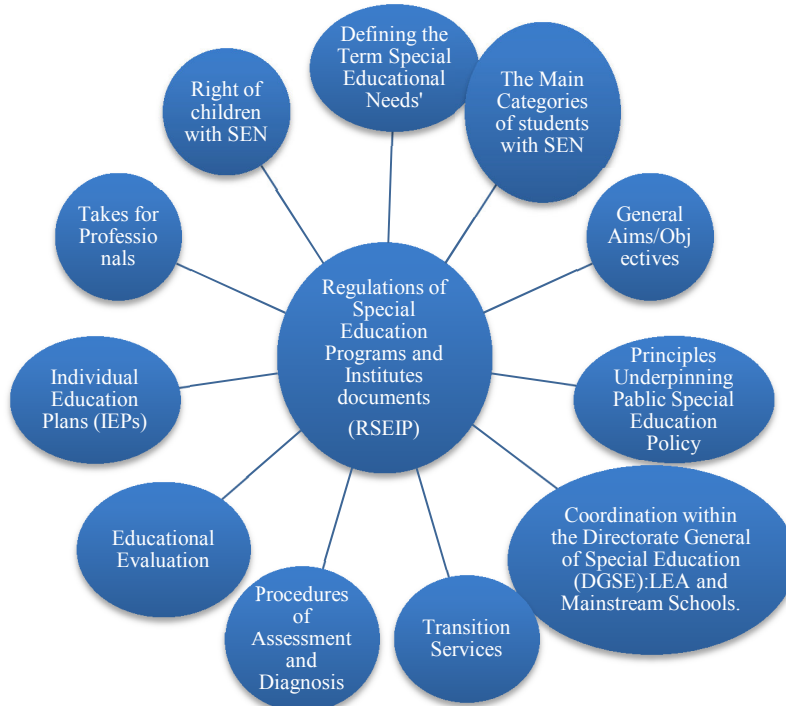
Figure 2. RSEIP Document Framework

Consequently, the RSEIP is in favour of providing special education services of good quality, on the one hand, and allowing the development and preparation of new regulations for future special education programmes in Saudi Arabia on the other (MoE, 2002). Figure 2 below shows the organization of the content of the document. The importance of the regulations lies in the organisation of the educational process, in the upgrading of the level of services provided and in the determination of the responsibilities and tasks assigned to the employees. In addition, regulations are essential since they can help in creating flexibility in the workplace and in reviving teamwork and team spirit among the multidisciplinary team.