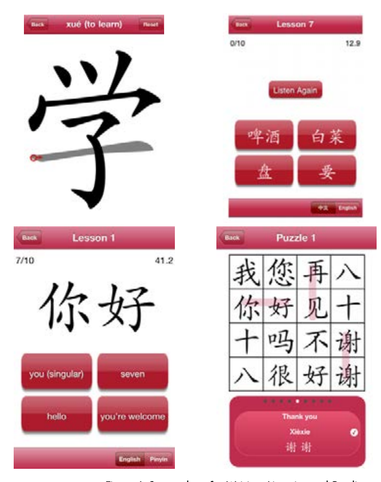
Figure 1. Screen shots for Writing, Listening and Reading sections and the Word search section

available shortens and the stroke order indicator disappears. As users complete each character, data is kept within the device memory to allow the users to see how many times they have practised it.