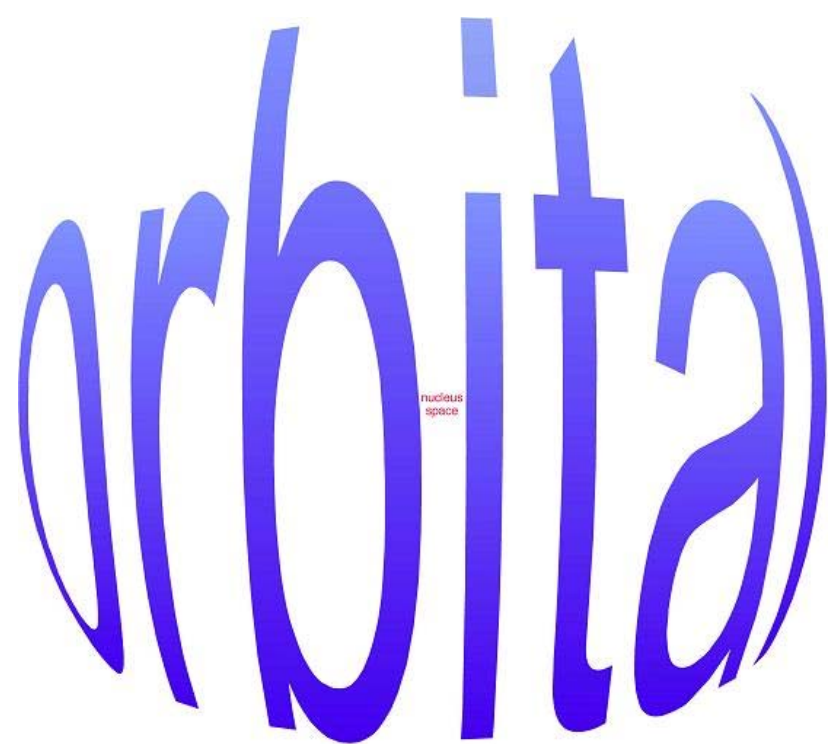
Figure 2. Typographic illustration of an atomic model.

A typographic approach is also used to illustrate the atomic model. Both the nucleus-space and the orbital-space are displayed using their names, the latter being made to look spherical. A shift of focus is created by using the two descriptive words themselves to illustrate the different spaces. This gives the impression of a three-dimensional atomic model while reducing the possible misimpression of orbits or shells (figure 2).