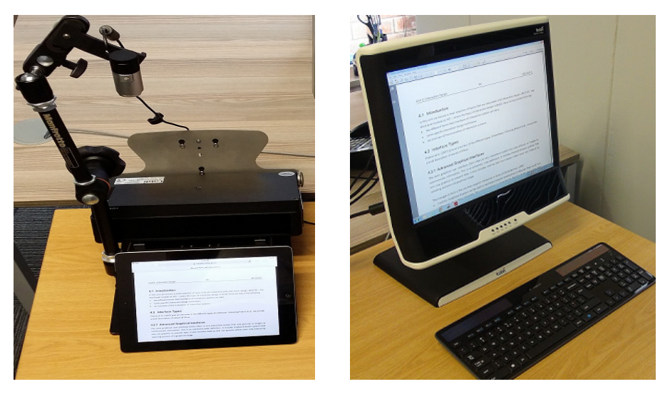
a.Tobii X120 and iPad b.Tobii T120 Eye Tracker Figure 3. Eye trackers – Left: Tobii X120, Right: Tobii T120 Eye Tracker

The Tobii T120 and X120 eye trackers have an accuracy of 0.5 degrees, a drift that is less than 0.3 degrees, sampling frequency of either 60 or 120 Hz and use infrared diodes to generate patterns on a participant's eyes. Eye tracking is the process of measuring the point of gaze or the motion of an eye relative to the head. Normal reading consists of a series of saccadic eye movements along lines of text, separated by periods of brief fixations during which the eye is relatively stationary and visual information is acquired from the text (Rayner, 2009). The eye tracking data was exported from Tobii Studio<sup>™</sup>. It is the eye tracking software that allows researchers to record and analyse eye tracking tests. The software supports the calculation of key eye tracking metrics in addition to tables and graphs to enable quantitative analysis and interpretation as well as display of results. The metrics can be exported to text, spreadsheet or to an analysis application. In this study, the researcher exported the statistical data to Microsoft Excel® . The inferential statistical analysis was done using the IBM SPSS Statistics.