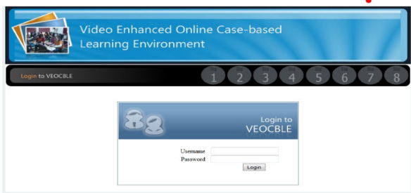
Figure 2. VOCABLE website.

Although the Plan phase was very long, the Act phase took only two weeks. Each week, students analyzed one case. During both weeks, the researcher and students had some technical problems. Moreover, it was seen that some parts of the first version of VOCABLE did not work effectively and some steps and scaffolds needed revisions. Therefore, at the end of the two weeks, the project proceeded to the Observe and Reflect phase. At this stage, which took one week, the researcher gathered data and analyzed them in a qualitative way.