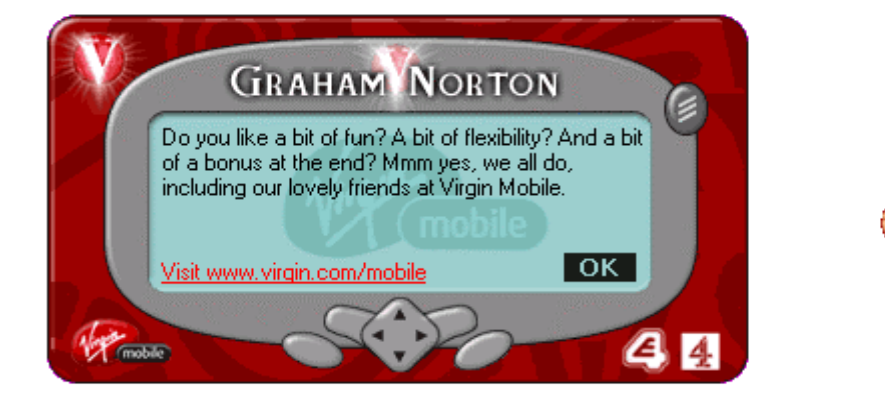
Figure 1: Example of Skinker and information box

As mentioned the word "Skinker" is also used to refer to the desktop agents that are used in conjunction with the Skinkers Communication Platform to deliver messages on people's computers. An example is the Skinker created for the UK TV comedian Graham Norton which was used to alert users about interesting content available on the sponsors web site (Virgin Mobile). This Skinker was developed for Channel 4.