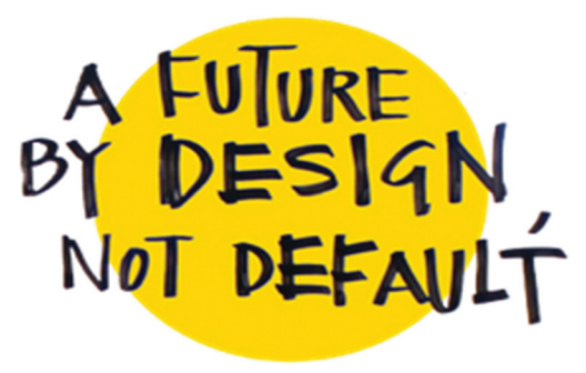
Figure 1. A Future by Design Not Default—Infographic by Sita Magnuson.

The purpose of the National Planning Forum grant funded by the Institute of Mu-