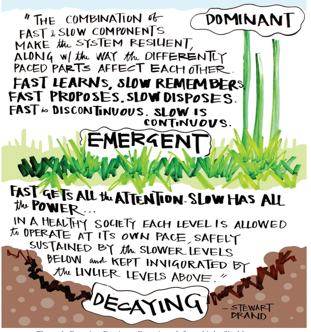
Figure 6. Decaying, Dominant, Emerging—Infographic by Sita Magnuson.