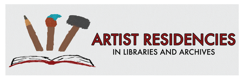
Figure 5. Artist in Residencies Graphic by Derek Murphy.

The first presentation and discussion took place at the New England Library