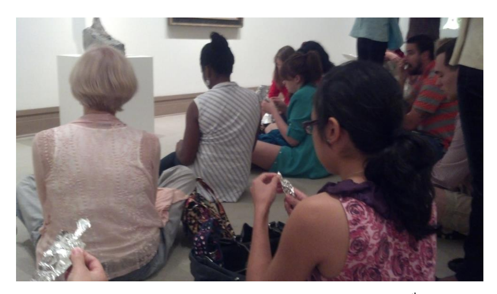
Figure 1. Participants creating aluminum foil recreations of a classic 20<sup>th</sup> century sculpture