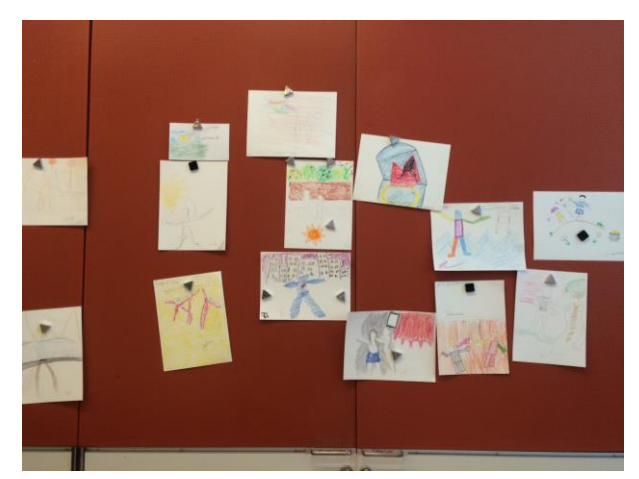
Figure 4. Participants view each other's sketches from the day for group discussion

At the conclusion of the gallery visit, participants returned to the studio space for final reflections. This provided them with an opportunity to process their experience with their group and the teaching artist. They were asked to share what they noticed about the teaching artist's methodology and how the classroom session prepared them for the museum visit.