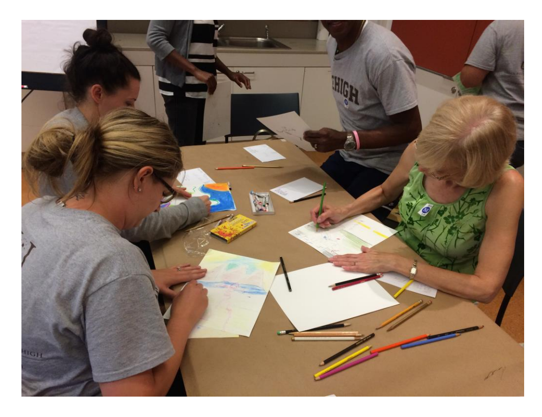
Figure 2. Participants explore portraiture through sketches