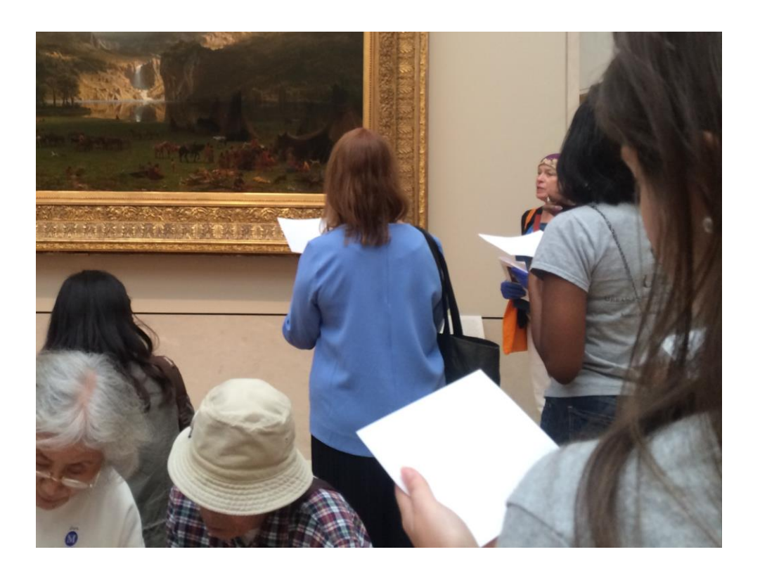
Figure 3. Participants view and discuss artworks