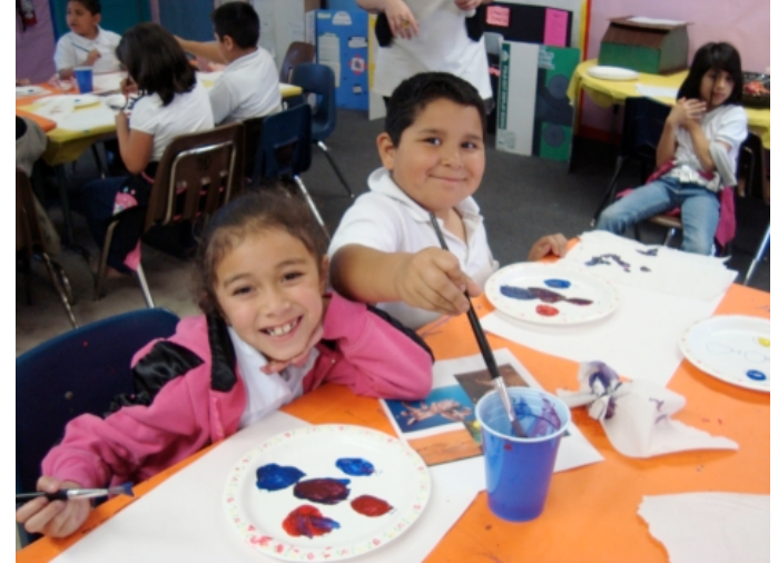
Fig 5 Jefferson Elementary School students study the color wheel and learn to mix colors.