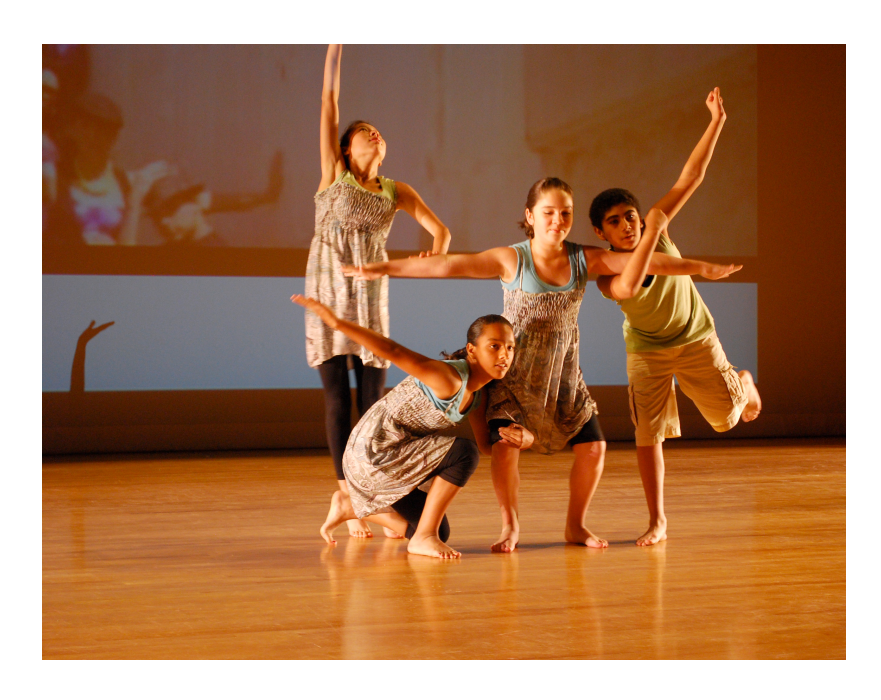
Fig. 4 Gage Middle School students perform modern dance at UCLA Symposium.

In California, the task of credentialing teachers in the approved arts disciplines has primarily been relegated to the California State University system, while research oriented universities have generally steered clear of this issue. However, there is a precedent for inclusion of arts education programs in research universities. For example, reputable research universities--including Harvard University, New York University, and the University of California, Berkeley--have begun to offer graduate degrees in arts education. Of the three aforementioned programs, only New York University offers a useful teaching credential in the arts along with the graduate degree. The flexibility of providing both a graduate degree plus a credential offers graduates greater options to pursue careers as arts administrators, researchers, or classroom teachers.