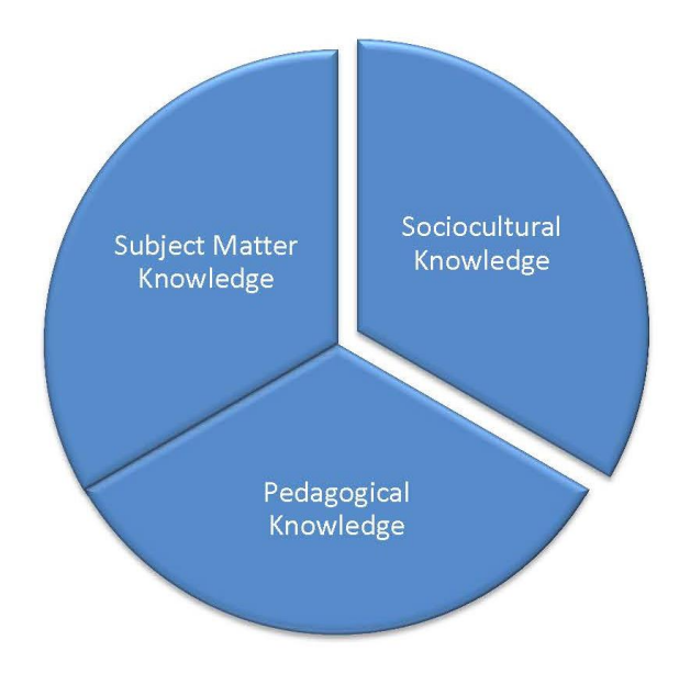
Figure 1. Core domains of teacher knowledge

removed from the arts, critical arts education is not attainable without a deep understanding of sociocultural differences. In the following section, we look to current practices and theoretical issues to understand what is at stake in helping teacher candidates to develop sociocultural knowledge.