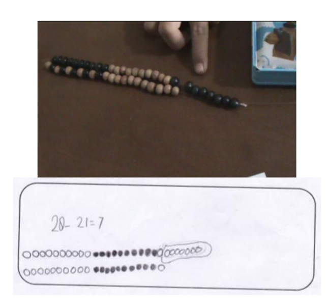
Figure 1. Comparing two grains bracelets Figure 2. Drawing two grains bracelets

Most students found difficulties to understand the meaning of "differences". The teacher guided them to put in a row and to compare the first and the second bracelet, like in the figure 1. They got 7 as the differences between those bracelets. After getting the differences, they realized that the context is also a type of subtraction problems. Then, the teacher asked the students to make a drawing that represents the situation and to write the mathematical notation from the context, as shown in the figure 2.