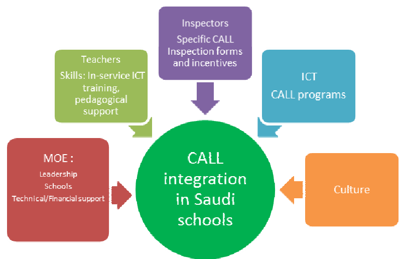
Figure 3: Integrating CALL in Saudi schools: An emergent model

This model includes the barriers discussed above that affect CALL adoption. These will be explored further with the aim of identifying possible solutions to mitigate them and making the model suitable for integrating CALL in the Saudi context.