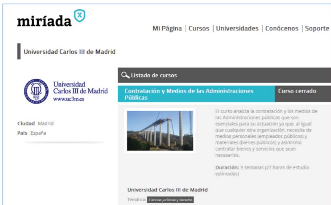
Figure 2: Contratación y Medios de las Administraciones Públicas on MiriadaX MOOC Platform

by the platform were used for communication with the students, and assessments were carried out using the interactive test and peer review of the case problems.