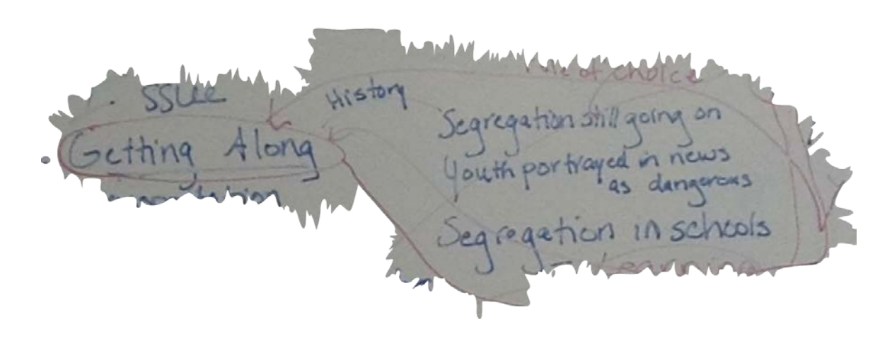
Figure 1. Discussion points during January PAR collective data analysis meeting held at the university in January 2013.

During this session, each team as well as the broader collective explored the survey results. We considered what ninth grade students reported, placing it in relation to contextual dimensions such as educational policy in the state and district, conditions local to schools and their neighborhoods, and what we have studied of local history. We located the key themes emerging from the survey data and drew connecting arrows to this broader context. See figure 1 for a photograph of a whiteboard reflecting a discussion during our January session.