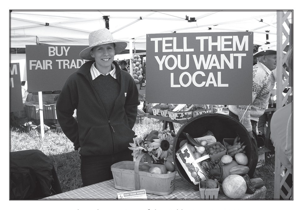
York student at Feast of the Fields, Ontario, 2009

global labour. This became an educable moment as progressive magazines posed the difficult question to environmentalists and local food activists: "In the quest for just and sustainable food practices, why is nobody talking about organic farming's dependence on migrant labour?" (Crane, 2012, p. 18); a Briarpatch issue focusing on "Decolonizing Food" featured an article "Food for All! Food Justice Needs Migrant Justice" (Adrangi & Lepper, 2011), also challenging food activists to take up this complex issue.