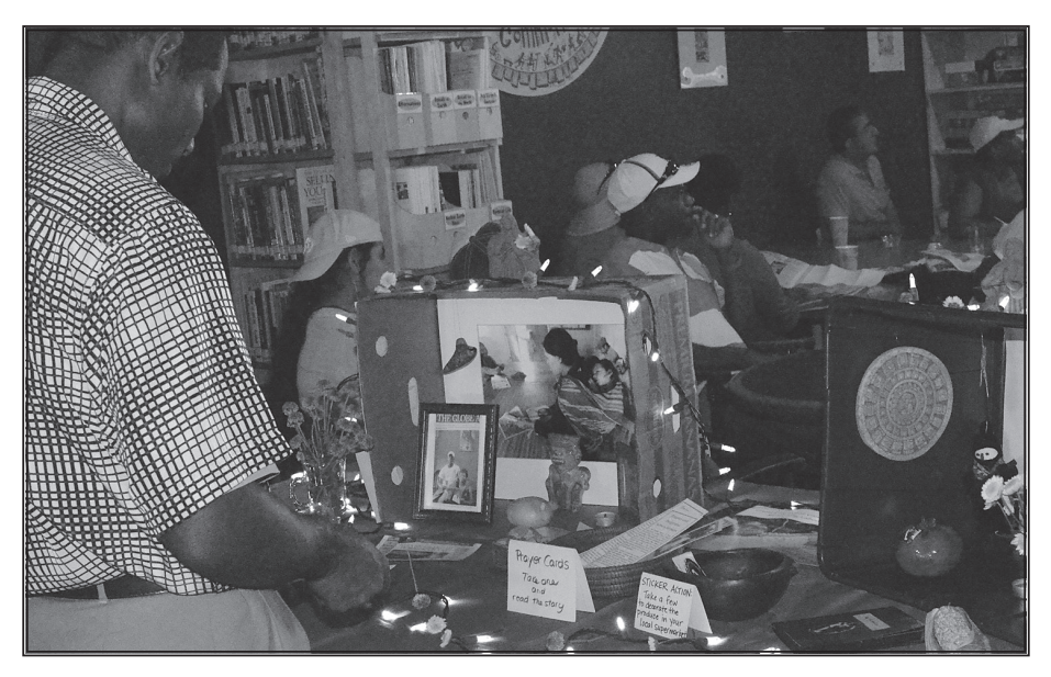
Jamaican migrant worker viewing altars at event in Kitchener, Ontario, remembering the Peruvian workers killed

of spirituality, influenced by the influx of diasporic populations who more easily integrate the spiritual and the political, this could still be an obstacle to using the altars for political pedagogical purposes. On the other hand, there are also faith-based allies of migrant workers, such as KAIROS, a national ecumenical organization of 11 churches and religious groups that works for ecological justice and human rights (KAIROS Canada, 2014); the altars could also be an entry point for potential support from congregations across the country, a significant social force.