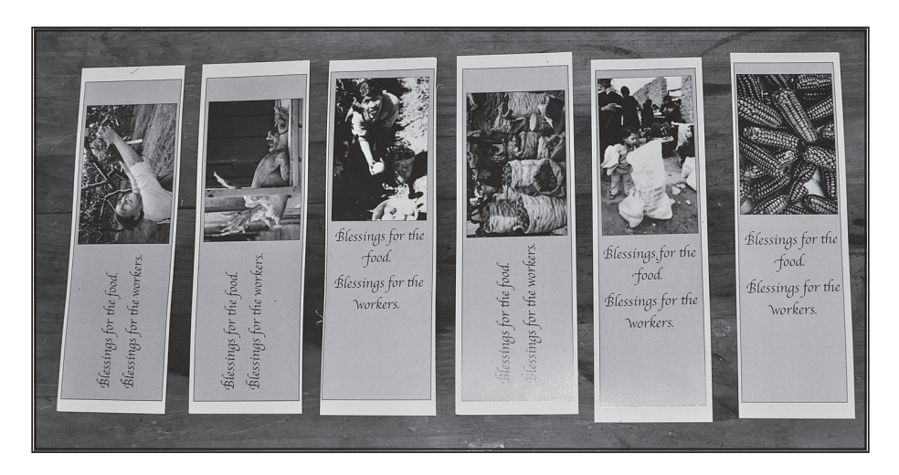
Prayer card photo

provide the text for the exhibit and reference many of the groups and analyses I've already noted above. Proclaiming on one side, "Blessings for the Food, Blessings for the Workers," they are organized by the six foods featured in the altars and migrant workers' stories. The reverse side elaborates on the historical domination of United States agriculture and the current corporate neoliberal model, on the struggle around corn sovereignty and potato biodiversity, and on the two migrant worker programs that are represented in the two altars. Finally, at the bottom of each card is the website of one group that is organizing around the issues discussed, from those mobilizing workers (Justice for Migrant Workers and the United Food and Commercial Workers) to those researching and leading campaigns (Sin Maiz No Hay Paiz in Mexico and the Erosion, Technology, and Concentration group).