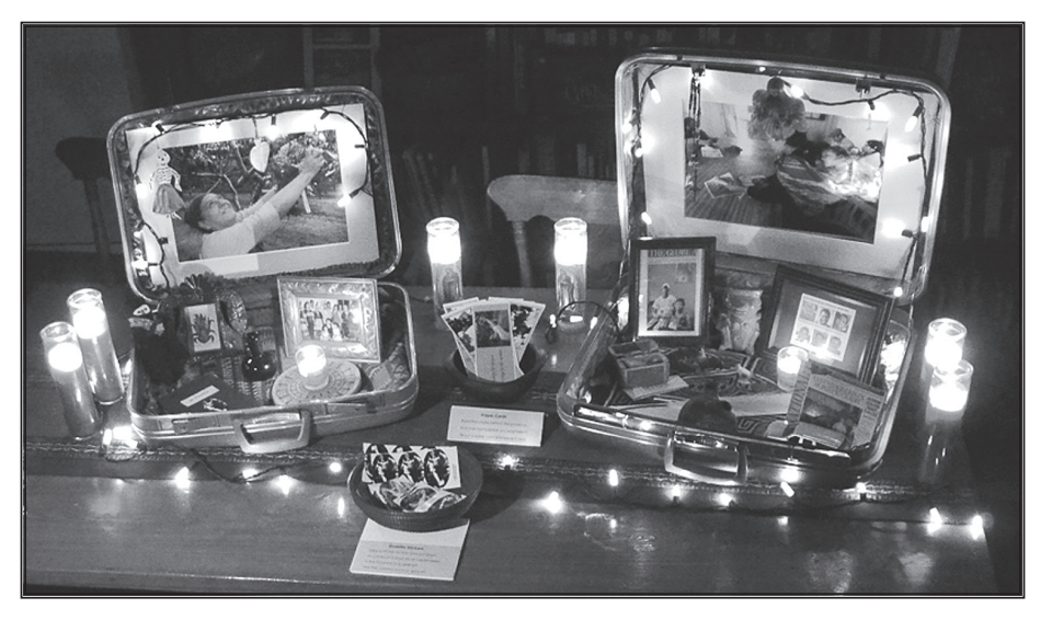
Altars reconstructed in suitcases to represent the migration process

Moving the altars across the country has led us to recreate them within suitcases that can be shipped and opened already assembled. The suitcase itself is a symbol of migration and allows the altars to be used by groups independent of me as an installation artist or facilitator. A set of instructions on their use accompanies the suitcases.