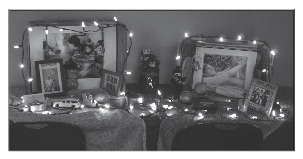
Original altars in boxes of the global imported food and local food program

The October 2012 showing was part of a Social Justice Conference at Ryerson University focusing on Decent Work, Decent Lives, and more particularly, was part of a day that I co-organized around "Local Food, Global Labour." A two-hour public panel invited two key migrant worker organizers (Justice for Migrant Workers and United Food and Commercial Workers) and two prominent food movement leaders (Toronto Food Policy Council and Food Secure Canada) to address the questions: How can we have both sustainable food and just labour? What is our organization doing to address the issue of migrant justice? The highlight of that gathering, attended by 100 students and activists, was emotional testimony by two surviving Peruvian workers, their first public appearance since the February accident. The public panel was followed by an afternoon workshop, "Building Alliances for Sustainable Food and Just Labour," explicitly bringing together 40 labour activists and food activists to explore points of tension and unity that would allow them to work together.