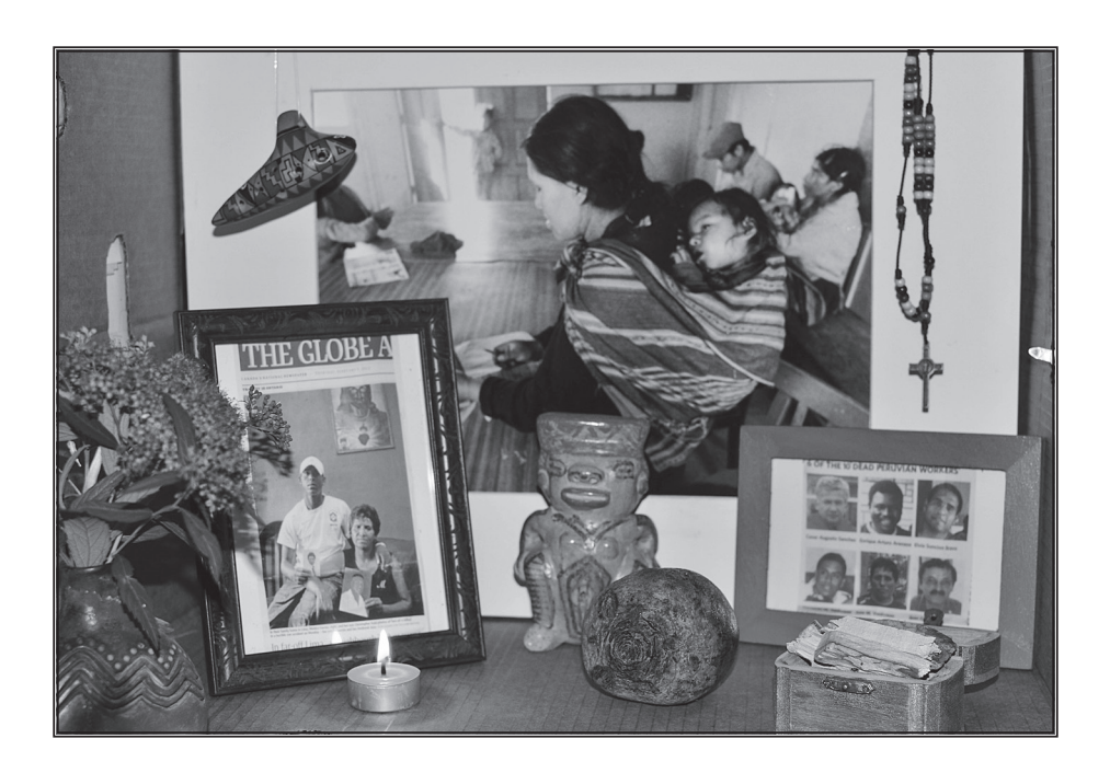
Altar to Peruvian workers killed in accident, February 2012

reproduced the dominant forms of cultural imperial media, privileged individual and professional production processes, and were used mainly to promote a lifestyle that was accessible to few. In contrast, the revolutionary government was promoting counter-hegemonic media whose content was drawn from ordinary peoples' lives and struggles, whose forms were homegrown and experimental; whose production engaged grass-roots communities in collective and culturally grounded processes, and whose use was to educate and mobilize the population to participate fully in creating a new more democratic society. I will adapt these four dimensions of art and media as a framework for reflecting on the altars.