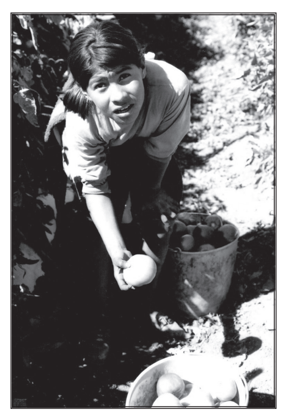
Tomato worker, Jalisco, Mexico

need to be in dialogue with each other and could be potential allies. But while the former focuses primarily on the rights of workers in a global context of increasing exploitation of a migratory and temporary racialized labour force, the latter emphasizes the creation of more sustainable food production countering the corporate industrialized agricultural system. I wanted to pose the more complex question to both groups: how do we create a food system built on both sustainable production and just labour?