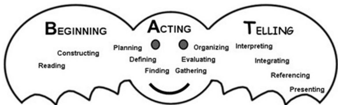
Figure 2: Beginning, acting, telling model: classroom instructional aid

A phenomenological, qualitative methodology was used, including interviews, participant observation, and surveys and questionnaires. Several posters of the simplified beginning, acting, telling model (Figure 2) were placed in the classroom to be used as visual aids. The researcher acted as a co-educator (participant observation), starting each class instructing the children on how to use the beginning, acting, telling model to help them with all aspects of the work required to successfully complete their projects. Each class had a different project: in one class students examined biospheres while in the other, countries of the world. While each individual student was required to submit a completed project, the students often worked together in groups, as they had to share resources. A research assistant observed the classes and made extensive field notes and the classroom sessions were audiotaped. Pre- and post-questionnaires were distributed to the students to determine any changes in behaviour and/or perceptions of the research process before it began and after it ended. Throughout the study, informal, semi-structured interviews were conducted with the teacher who acted as the main instructor for the two classes and of the two individual classroom teachers. Any non-textual data was transcribed. Analysis of the data consisted of coding for major themes and patterns according to practices outlined in Lincoln and Guba (1985) and Patton (2002).