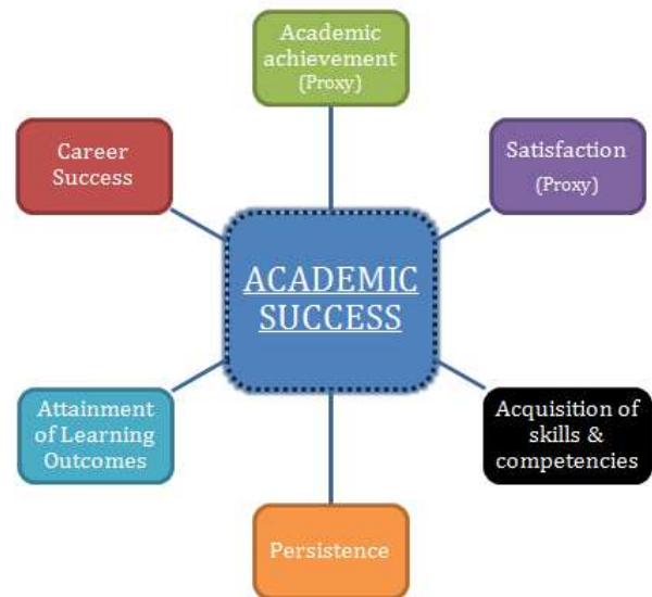
Figure 2. York, Gibson, & Rankin Revised Conceptual Model of Academic Success

A revised definition and model. It is with this critique in mind that we present an amended definition and conceptual model of academic success (Figure 2). Based on our findings we define academic success as inclusive of academic achievement, attainment of learning objectives, acquisition of desired skills and competencies, satisfaction, persistence, and post-college performance.