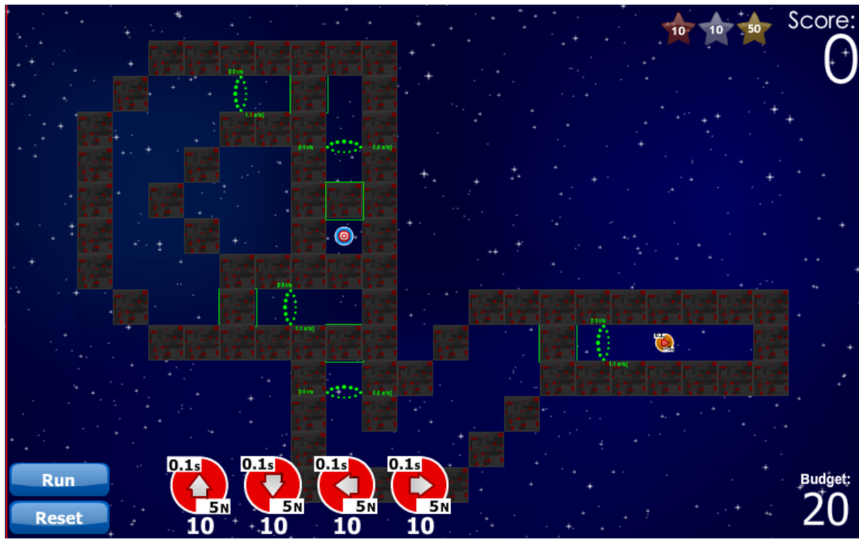
Figure 2. More elaborate SURGE Next "Boss" mission