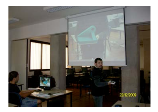
Figure 1. Using Augmented Reality with PC and mobile devices in an Engineering course.

The infrastructure needed for setting an AR system on the classroom is a computer, webcam and projector. The teacher manipulates virtual objects and can interact with them for supporting his explanations. The books or class notes from students include the right markers so they can interact with the augmented information and be visualized. The students will be able to visualize the information in a PC or in an AR application that has been developed for smartphone in both Android and iOS operative systems (figure 1).