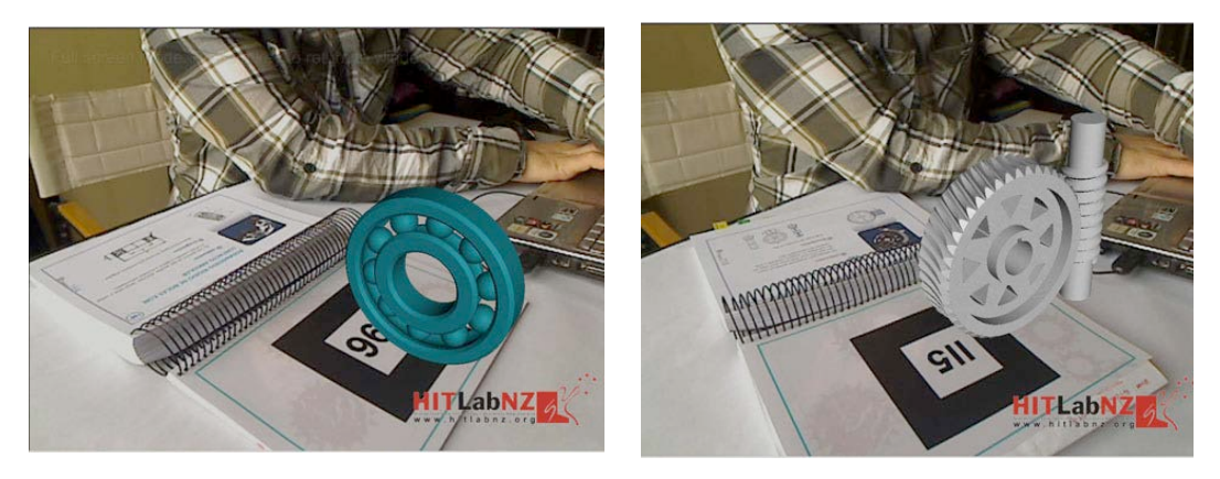
Figures 3 and 4. Augmented Handbook edited for engineering students.

The L-ELIRA interface is an augmented book consisting of two volumes of eight chapters: (1) Simple thread elements. (2) Non thread simple elements (3) Security device, (4) Bearings, (5) Gears, (6) Spring, (7) Motionless Machines (8) Machines in motion (figure 3 and 4). Each chapter has an introduction with the theoretical contents and the matching technical card for each standard element. The card contains information on its use, rule number and standard element designation. Besides this, it also contains graphic information about standard representation, photorealistic images and a marker, which allows visualization of the 3D standard element from any point of view through augmented reality using BuildAR, open source version (HITLab, 2006).