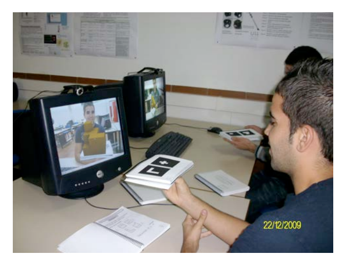
Figure 2. Training through Augmented Reality in EHEA Degrees

The first exercise of each level and its typology has a physical gesture related that must be performed by student for figuring out its solution and understanding how to solve it. The gesture performed consists in getting the mark closer to the camera so the solution will come up as seen on picture.