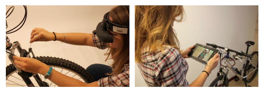
Figures 7 and 8. A student of engineering repairs a bike guided by the augmented instructions.