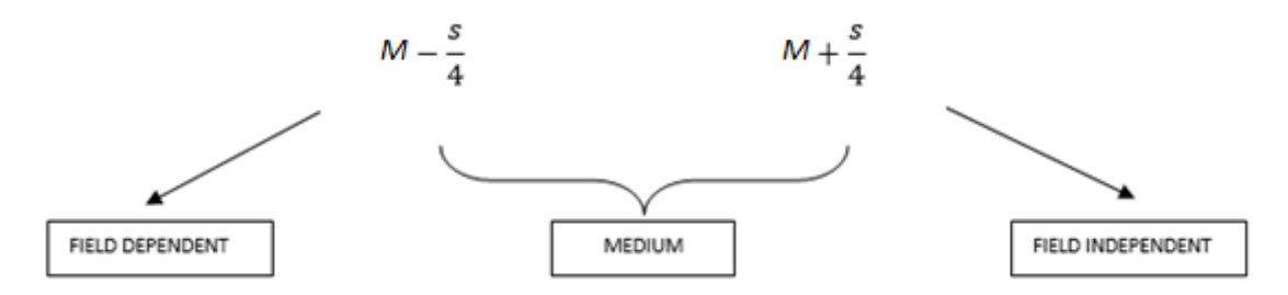
Figure 2. The formula used to determine the cognitive style categories of the teacher candidates

The minimum score of the test is o whereas the maximum score of the test is 20. The teacher candidates were categorized as field dependent, medium and field independent according to the scores they obtained on Group Embedded Figures Test. The teacher candidates' cognitive styles were determined according to a criterion used by Case (1974), Case and Golberson (1974), Scardamalia (1977) and Alamolhodaei (1996). Teacher candidates who had a score less than \frac{1}{4} standard deviation below the mean were classified as field dependent (FD < M - \frac{1}{4} s), \frac{1}{4} s above the mean were classified as field independent (FI > M + \frac{1}{4} s) and between ( M \pm \frac{1}{4} s) were those who may be located between the above two styles who were labelled as field-intermediate learners (Alomolhodaei, 2002) (See Figure 2).