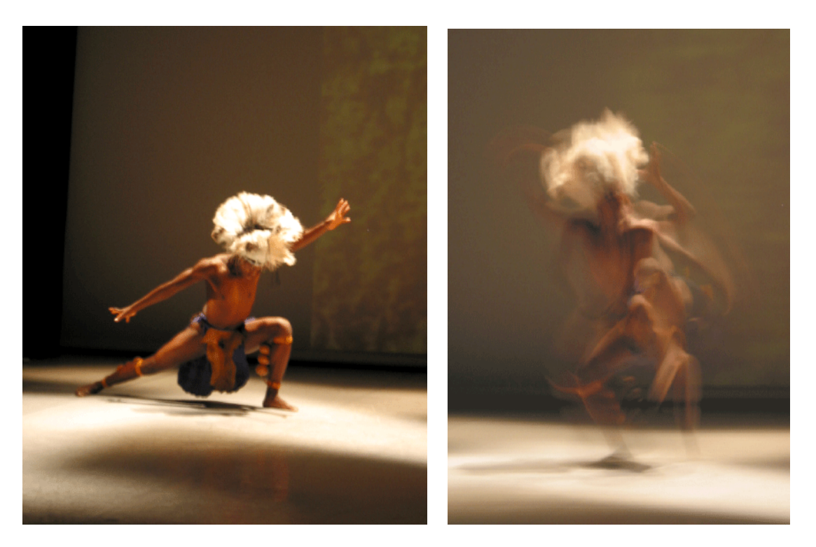
Figure 6: Stills from Ngirozi. On the left, digital scenography fills the right hand side of the image; to the right, the dancer in full motion is pictured in a still from a digital camera

Zimbabwean participant Jimu Makurumbandi, is presented in detail here (Figure 6). This was a narrative piece with a mix of southern African dance styles (Morrison 2003b). The overall research question was: What issues of cross-cultural communication emerge in the development of digital sceneography for narrative-led dance performance work?