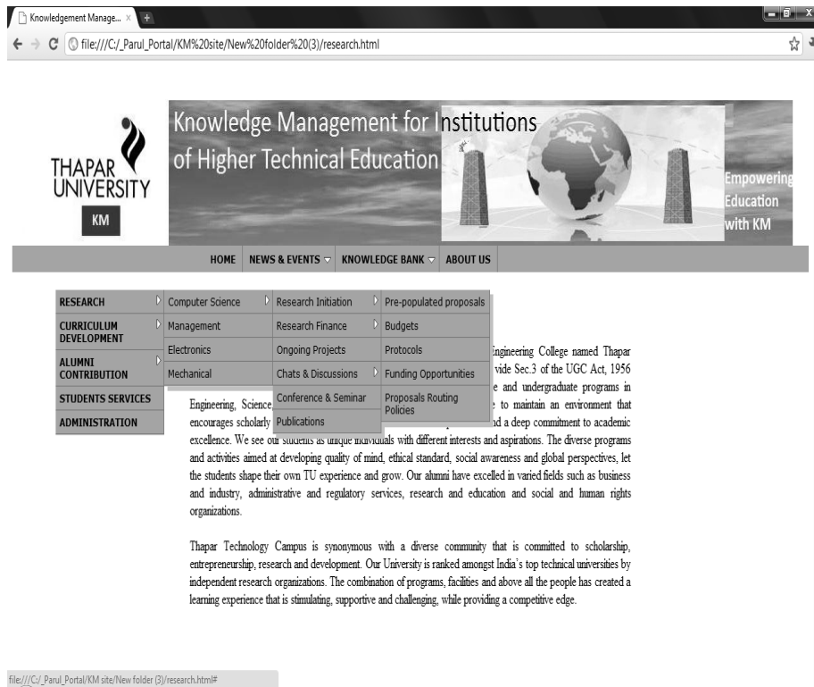
Figure 2. Developing a Knowledge Management Portal for Higher Educational Institutions

On the basis of inputs given by the academia, it is possible to construct highly usable and intuitive interfaces, which will facilitate invention, sharing of knowledge and helping to avoid reinventing the wheel. It may be used as a framework, shown by Fig. 2, in developing a Knowledge Management portal for higher educational institutions.