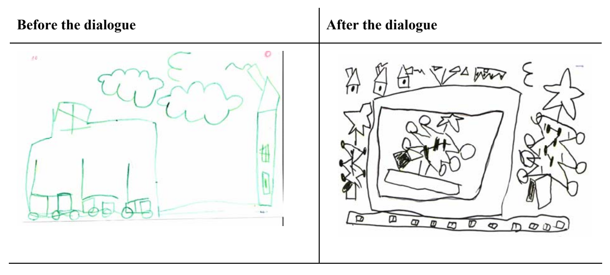
Figure 5. Drawings of a skillful but frightened child, who is afraid of the unknown

In the figure 5 we can see drawings of a girl, who was characterized by her teacher as skillful but frightened child, who is afraid of the unknown. This girl doesn't want to communicate with us verbally, she started crying during talk with us, but her drawings prove that she was listening to us. She understood our task and her numerical conceptions were influenced by our dialogue with children in which she did not take part.