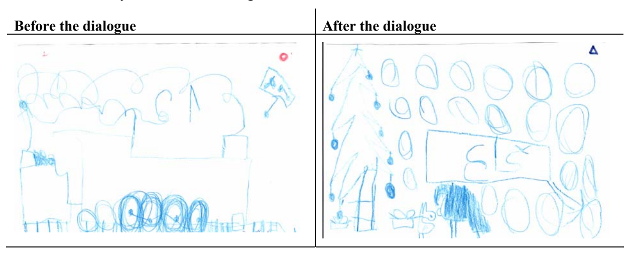
Figure 1. Pictures without concept to number 3

Some children could react correctly after the dialog, but three of them were not able to create any concept to number 3 in their pictures even as those pictures were richness (figure 1). Children who did not create any model seemed in general to be weaker in other educational activities, too or these were children with delayed school commuting.