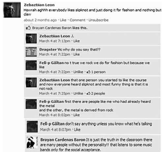
Figure 6. Social Rejection of the Others

The comment showed in Figure 6 created a controversy among the participants. As Polhemus (2000, cited in Palloff & Pratt, 2007) stated, students were able to give their points of view when they used personal forms of address, acknowledgment of others, expressions of feeling and humor, sharing, and the use of textual paralanguage symbols such as emoticons, font colors, different fonts, capitalization, and symbols or characters for expression in their post interventions.