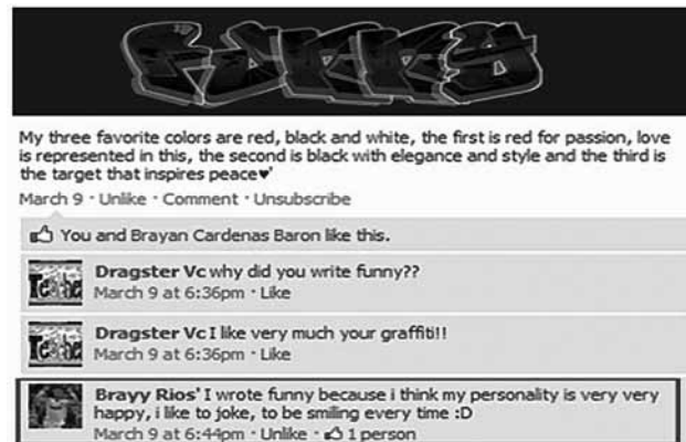
Figure 3. Bravy's Graffiti Narrative

Students portray themselves with unique characteristics different from other members of the group. First, the imagination of the teenagers’ appearance to the other members in Dragster was represented through their own imaginations by using profile pictures, either of themselves or their favorite artists, as well as creating fictional names for the virtual community. Their names were asked to be distinctive and to represent something they identified with. For example, we could see in the excerpt below that Bravy had a photo of Cristiano Ronaldo as his profile picture. According to him, this soccer player was his favorite sportsman. Also, he said “Cristiano looked just like me when we are playing on the field” and he was using his picture to support him during the Champions League Cup final that was being played in Europe at that time (Interview, March 24, line 23). In this case, one notices how “me” is the perspective or “attitude” toward oneself that one assumes when taking the role of a specific person or the generalized community (Ashmore, 1997). Therefore, the other participants corroborated that Bravy was interested in playing soccer and had similar physical characteristics to Ronaldo’s.