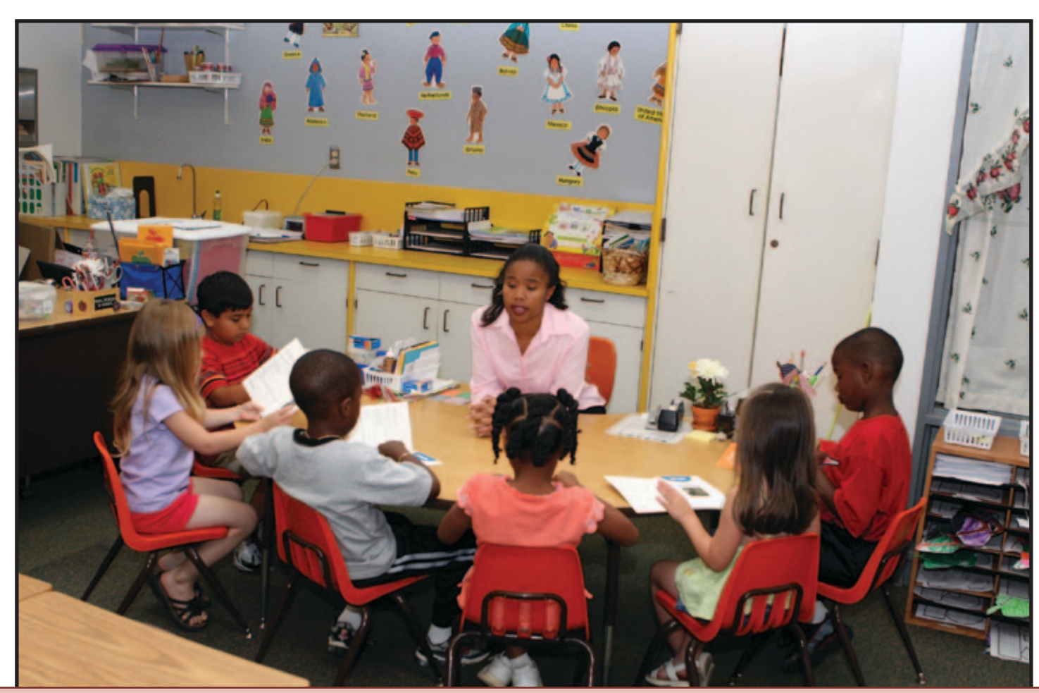
Connect children's "islands of competence" by providing many group activities.

Acceptance means knowing the disposition and temperament of the children in your care and working to begin where they are in order to move forward in building resilience. For example, some children need lots of practice in social skill building or following the rules, while some need lots of practice in learning cognitive concepts. One is not more important than the other, so we can begin to think of social skill building or