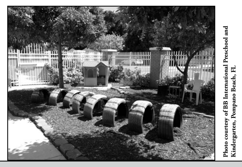
Quality outdoor play environments encourage children to explore and provide a place for children to engage in motor, cognitive and skill development.

discovery and pretend play that they can learn about themselves, their peers, and their world. Whenever possible discovery play should be present in the outdoor environment. There are many variations that can be designed. For instance, stages, gazebos, decks, and amphitheaters are ideal to encourage pretend play. In addition, storage is critical around outdoor spaces. Tricycle routes, playhouses, mailboxes, gas pumps, and dramatic play vehicles should be added to stimulate pretend play. "Dramatic play props" such as dishes, cash registers, and dress-up clothes should be organized and secure. Several smaller storage units near each play area may work better than a single large storage shed.