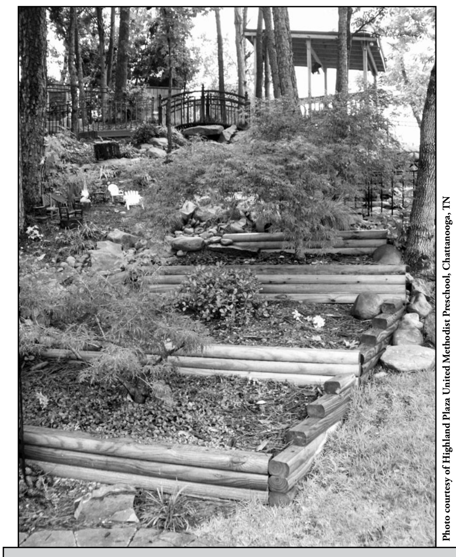
Outdoor play spaces should be intriguing and appropriate for young children. They should invite children to discover and learn as they spend time outdoors.

Early childhood educators are well aware of the importance of setting aside time for young children to explore outdoors and the value in providing outdoor environments that encourage learning and development. While there has been a recent emergence of getting young children outside and connected to nature, a more comprehensive discussion about what constitutes a quality outdoor play environment is needed. Childhood is a time for discovery and learning. There has been a tremendous amount of literature written about the importance of play and outdoor play for young children. Outdoor play has been observed by researchers and it has been repeatedly stated that playing outdoors encourages children to communicate, to express their feelings, investigate and discover the world around them.