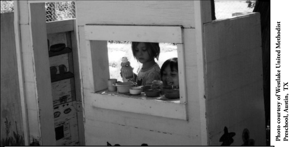
Areas for dramatic play, such as this outdoor space that can be transformed by both teachers and children into a variety of settings, provide the opportunity

of the children using the space. Public playground equipment is built for children ages 6 months to 23 months, ages 2-5, and ages 5-12 (Consumer Product Safety Commission, 2011).