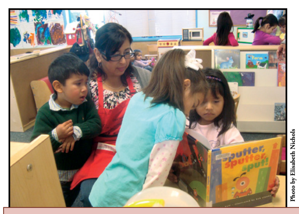
A prekindergarten classroom may be the first time that children interact with others from different cultural backgrounds.

share similar ethnicity, race, and/ or language(s), variations in background experiences and family expectations exist. For example, gender expectations may vary from family to family in terms of the types of toys children are encouraged to explore, such as dolls for girls and trucks for boys. Value systems may also differ among families. In some families, developing a sense of independence at a young age is desirable, while with other families, dependence on others is favored (Gonzalez-Mena, 2008).