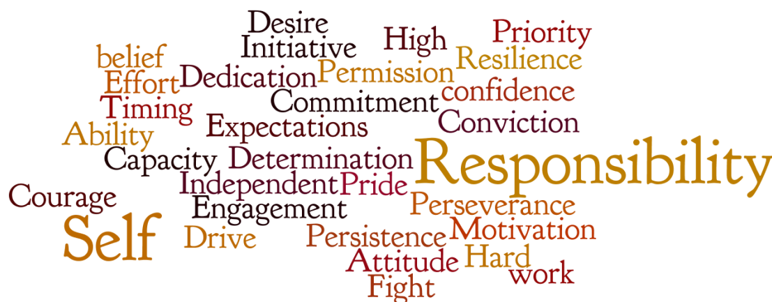
Figure 2: Sub-theme II model of student personal attributes for success.

Critical to the success of Indigenous students, irrespective of the available support, was timing. This included the timing of undertaking the nursing course and studying in relation to their family and community roles and responsibilities. Timing also extended to the complexity of their social needs such as housing, income, and childcare, and the personal health of the students, their families, and communities. “There’s [sic] certain social reasons ... they’ve just been on struggle street, you know, emotionally for so long that it becomes overwhelming. And sometimes, time is the only thing that helps” (IA).