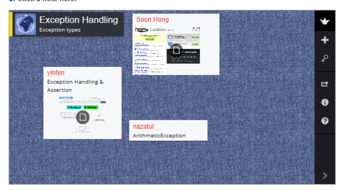
Figure 3: Padlet is integrated on a blog for question item in the learning plan.