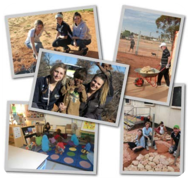
Figure 3: Remote Aboriginal community school environs (Printed with written permission from the school principal and participants)