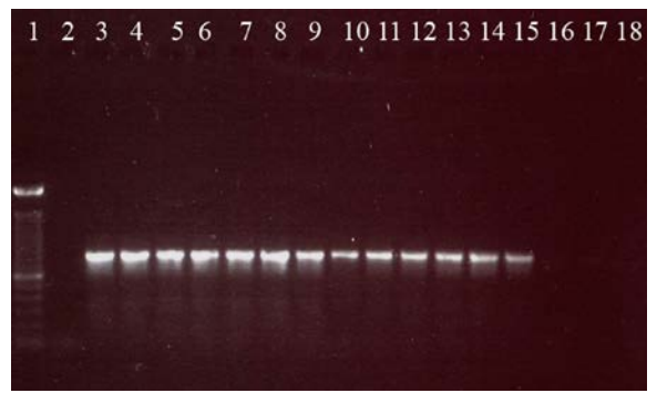
Fig. 2. Confirmation of efficacy of rinsing with 10% bleach on transmission of Nora virus via RT-PCR. Lane 1 = 100 bp Ladder; Lane 2 = Negative (water) control; Lane 3 = Positive (Nora virus RNA) control; Lane 4-6 = Control P; Lanes 7-9 = Experimental P; Lanes 10-12 = Control eggs; Lanes 13-15 = Control F1; Lanes 16-18 = Experimental F1. The product seen in Lanes 3-15 is approximately 800 bp, which is the expected size for the Nora virus product.

(Habayeb et al., 2009). This was deduced due to the fact that eggs rinsed in bleach gave rise to F1 progeny that did not test positive for Nora virus. If vertical transmission was demonstrated, the F1 progeny would have tested positive for Nora virus because the virus would have been transmitted from mother to offspring inside the egg, not on it's surface. Interestingly, the control eggs tested positive for Nora virus after washing with Drosophila Ringer's solution, suggesting while the flies are laying eggs they are also shedding virus. This would provide an efficient way to transmit the virus to newly hatched larva as they would likely start eating the contaminated food in close proximity to where their egg was laid. Also, the intensity of the Drosophila Ringer's washed control eggs and adult control F1 flies Nora virus product appears to be less than that of the P flies (Figure 2, Lanes 10-15 versus Lanes 1-6), even though there is no significant difference when quantitated (Figure 3). This suggests that