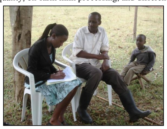
Figure 2. Farm visit interview conducted by an AgShare student.

Farm visits were conducted to assess the status of individual dairy farms in the AgShare study area (figure 2). In the study area (Kiruhura District), four sub-counties were selected for the study (Kinoni, Keshunga, Kikatsi, and Rwemikoma), and a paired matched sampling method was used within each sub-county to select farmers for participation in this study. Approximately 60 farmers were interviewed from each sub-county, and a total of 236 farmers participated in the farm visits. Structured questionnaires were administered by MSc student researchers to every farmer in order to collect information regarding the farm's milk production, milk quality, on-farm milk processing, and different channels for selling milk.