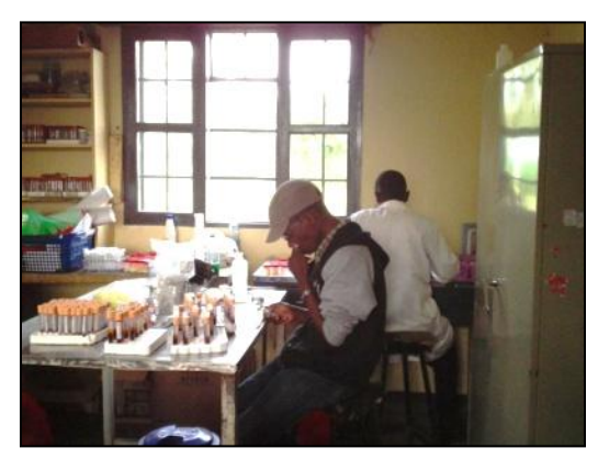
Figure 3. Laboratory testing completed by an AgShare faculty and student.

diseases in cattle. Six farms were selected by their participation in the Amate Gaitu Cooperative; six other farms with a history of high levels of brucellosis were randomly selected by the sub-county veterinarian [2]. The student researchers were involved in contacting and interviewing study farmers, collecting blood and milk samples, conducting laboratory tests for mastitis and brucellosis (figure 3), observing and recording farm hygiene scores, and providing educational materials and training to the 12 participating farms.