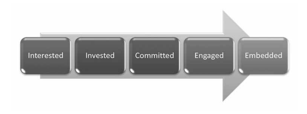
Figure 2: Embedded Learning Processes (Richlin, 2006)

In this sense, a community of practice emerges, in which students constructed a new and personalised meaning associated with working with Aboriginal people. The complex interaction between tacit knowledge and active immersion necessitated a seamless process that promoted interest, investment and commitment on the part of the student. From there, any previously held assumptions could then be challenged and reframed. This reframing in turn promotes engagement with, and application of, new knowledge within professional practice settings (Kincheloe, 2005). The last point relates to the embedding element of the overall transformative process. An example of the embedded learning process emerging from experiential learning cycles is depicted in Figure 2.