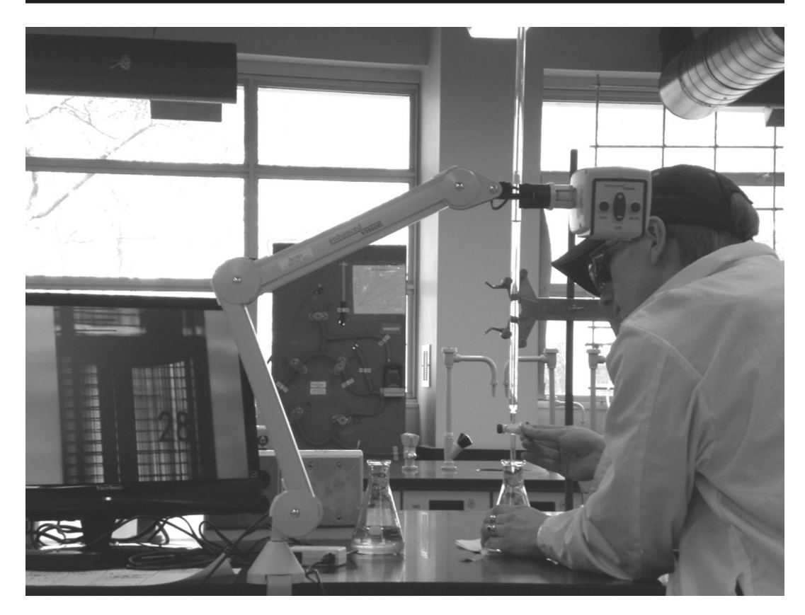
Figure 1. The apparatus being used in the distance view during a titration. The meniscus and the gradations of the burette are seen on the LCD screen at the left.

A significant but initially unanticipated use for the distance view mode of the device was to enable the student to view and record notes written on a chalkboard for the first time. When the camera had to be repositioned for a new task, it automatically focused on the new section without the need to readjust the magnification.