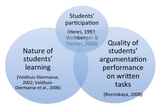
Figure 1. Proposal of methodological model to analyse written and asynchronous group interaction

The methodological model comprises three dimensions shown in figure 1. These dimensions appear intertwined –although with different level of contribution into the model- in order to provide a whole picture of learners' interaction.