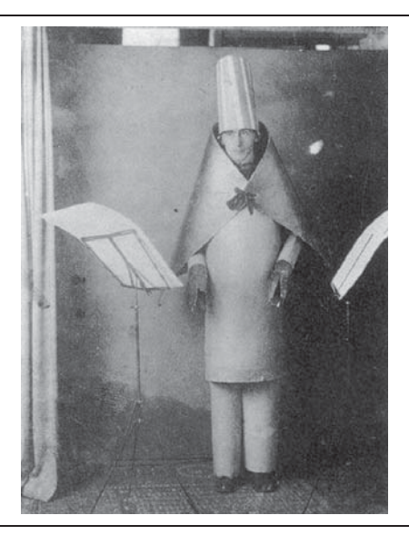
Figure 3. Hugo Ball reciting the sounds poem Karawane at the Cabaret Voltaire, Zurich, 1916. Anonymous photograph.