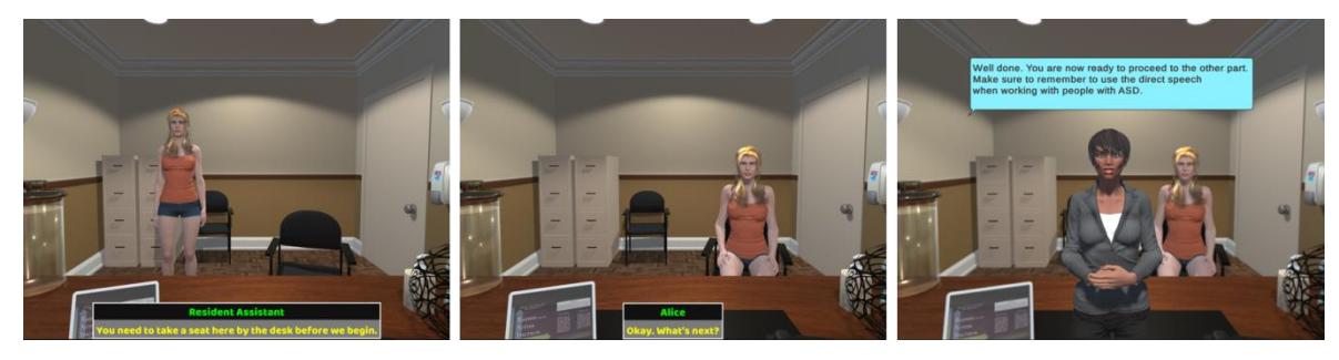
Figure 8. Sample Role-Plays and Reviews in the Direct Communication Module