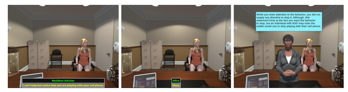
Figure 12. Sample Role-Plays and Reviews in the Nonverbal Interfering Behaviors Module