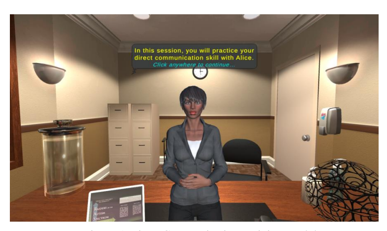
Figure 5. Direct Communication Training Module

In this part of the game, the learner is taking the role of a college resident assistant who will meet with Alice in the office as shown in Figure 5. Scripted role-plays, as shown in Figure 6, are particularly designed and adopted to create a rich learning experience on how to communicate effectively in direct and action-based communication when interacting with autistic people. The learner can try different communication styles/options and then observe the corresponding response of Alice, thus supporting the cognitive learning process of the learner. To further enahance the learning, Prof. Erika Parker will provide an immediate review of the plays and facilitate the focused discussion on the communication strategy. Further roleplays may follow if needed based on the learner's performance and progress as shown in Figure 7 and 8.