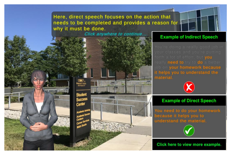
Figure 1. Alice with ASD