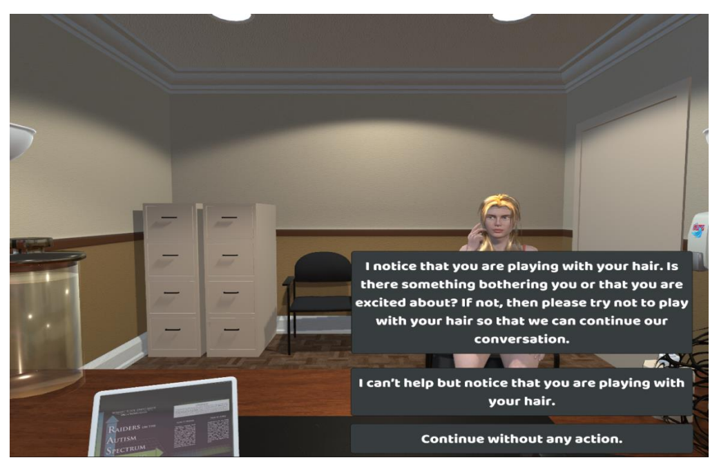
Figure 10. Scripted Nonverbal Interfering Behaviors Role-Plays