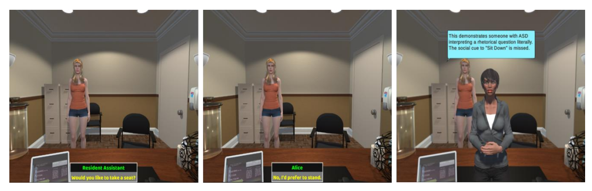
Figure 7. Sample Role-Plays and Reviews in the Direct Communication Module