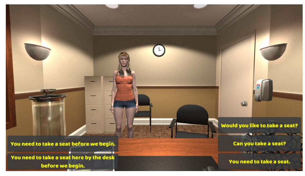
Figure 6. Scripted Direct Communication Role-Plays