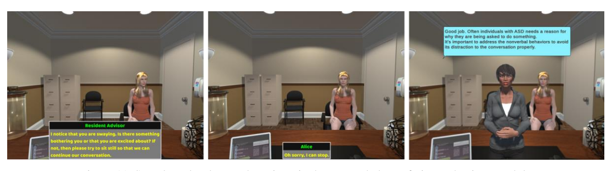
Figure 11. Sample Role-Plays and Reviews in the Nonverbal Interfering Behaviors Module