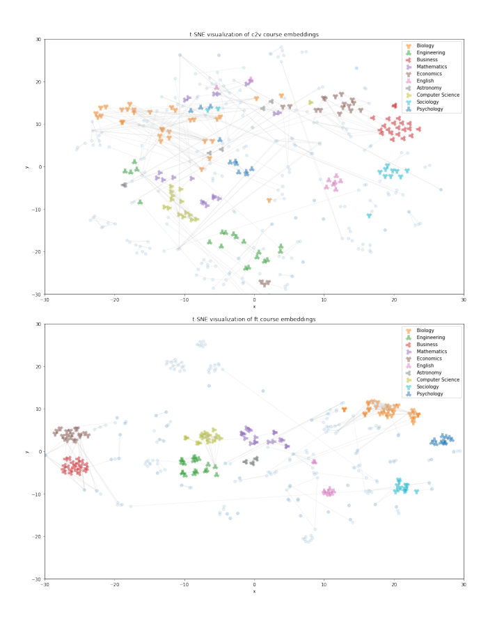
Figure 2: TSNE visualizations of courses in selected departments created by skip-gram and FastText

In general, the best model overall is FastText trained on random (within-semester) ordered E & D transactions (evaluated by averaging the E and D embeddings), with a recall@10 of 0.464. And the best model trained only on enrollment events is FastText trained on randomly (withinsemester) ordered events, with a recall of 0.445.