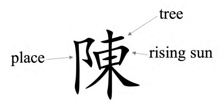
Figure 1. Chinese characters for "Chan"

"Humility, in the Ojibway world, means 'like the earth. ... [H]umility ... is the foundation of everything. Nothing can exist without it." (Wagamese, 2011, rearranged, p. 9).