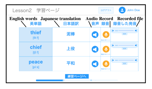
Figure 1. The user interface of learning process

The system consists of a learning process (see Figure 1), an output process (see Figure 2), and a self-assessment process (see Figure 3) for English vocabulary learning. First, learners enter a learning process and engage in English vocabulary learning by comparing the English word with its translation. After learning vocabulary, learners move to the output process to pronounce the English words learned on the learning page. In the output process, the speech recognition system displays the dictation text, which is then checked against the word information to determine if they are correct or incorrect. If all the words are pronounced correctly, the learner is redirected to the learning page of the next lesson. However, even if one word is uttered incorrectly, the learner is redirected to the self-assessment process to reflect his/her learning outcome on the output page and learning strategy on the learning page based on MS by LA. When the learner has answered all the questions correctly, the system moves to the next lesson. This cycle is repeated to encourage learners to understand the importance of audio information of vocabulary and encourage the use of vocalization strategy on the learning page.