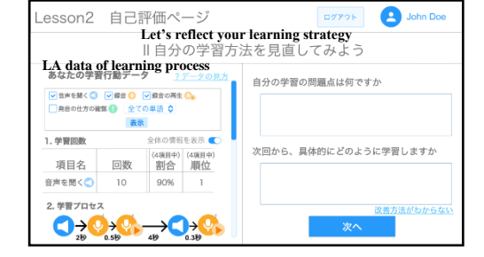
Figure 3. The user interface of self-assessment process processs