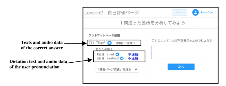
Figure 7. The process of identifying learning problems