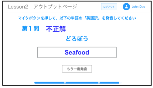
Figure 6. Right and wrong judgment