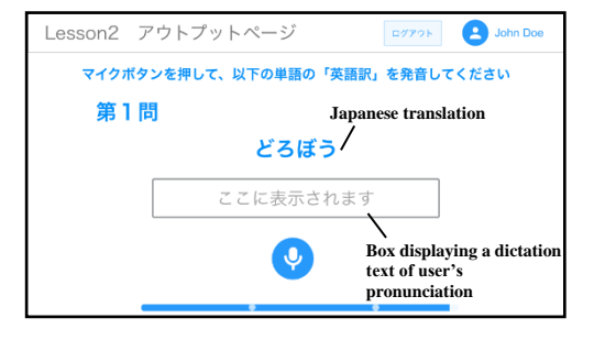
Figure 2. The user interface of output