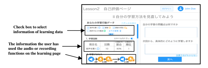
Figure 8. The process of reviewing learning strategy