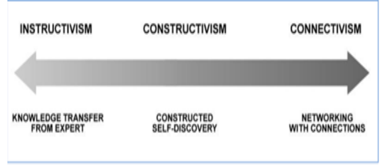
Figure-1 Learning Theories at a Level (Crosslin, 2016)

As a learning theory, connectivism provides a perspective on the dynamics of networks, environments and ecologies that support a continuous learning process. According to this view, learning is a highly network-based process in which learners see external resources from a holistic perspective (Marhan, 2006). In general, as the need for learning from the teacher increases, the lesson should rely on traditional teacher-centered education. However, as learners benefit from individual exploration and reflection, there is a trend towards the constructivist approach in the lesson. When learners acquire knowledge through their interactions with other learners and networks, the course tends towards the connectivist understanding (Figure-1). These three paradigms should not be considered completely independent. In the real world they can coexist and exist.