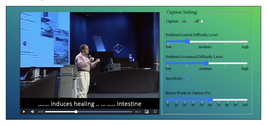
Figure 1. PSC with self-regulation features to adjust the caption based on preference

vocabulary reservoir but less tolerance in coping with fast speech or vice versa, we have incorporated a user-friendly interface to adjust the system's features and override the default parameters. This enables increasing or decreasing the number of words shown for personalization and promotes autonomous and self-regulated learning (Figure 1).