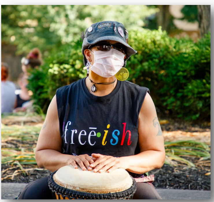
[Image description: Photo of a masked femininepresenting person of Color playing a drum, with a sleeveless t-shirt on that says "freē-ish," with the "ish" in multicolors, representing the intersection of race and LGBTQ.]

If you see any instance of a student being bullied by peers for their sexual orientation or gender identity, address the situation immediately, name the behavior, use it as a teachable moment, support the targeted person, and hold aggressors accountable. Also, encourage your students to hold one another accountable.