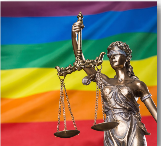
[Image description: Photo of a statue of the blindfolded goddess of justice Themis against the rainbow flag.]

includes the Due Process clause, which prohibits any State from depriving "any person of life, liberty, or property, without due process of law<sup>21</sup>." As an example of one way that the Due Process clause can be used to protect students is if a state gives students a right to public education, but says nothing about discipline, then the state cannot take away that right from a student – through expulsion for misbehavior – without providing fair procedures, in other words, "due process<sup>22</sup>". The Supreme Court case responsible for clarifying this protection is Nabozny v. Podlesny , circa 1996, when a middle school student in WI, who was mercilessly bullied at school, filed suit against several school officials and his school district; he alleged that his 14th Amendment right to equal protection was violated by discriminating against him on the basis of both