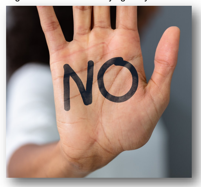
[Image description: Photo of a person holding their hand out, with the word "no" written on their palm.]

Under Title IX, schools are legally obligated to protect all students from sex-based harassment on school property, including the school bus, as well as on field trips and any school-sponsored events. If a student feels that they are being harassed by anyone at school (e.g., peers, teachers, other adult staff, etc.) to the extent that it is interfering with their education and that the harassment is being encouraged, tolerated, inadequately addressed, or outright ignored by school employees, that school may be in violation of Title IX. Much of the conduct that might be considered "bullying" may be