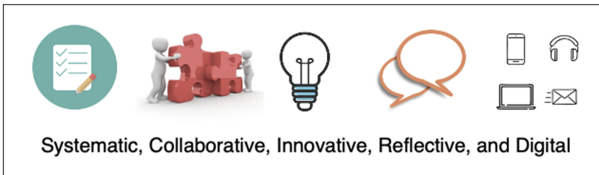
Figure 1. The five dimensions of CPD

The first key dimension of CPD is that it should be systematic and ideally it needs to be introduced and fostered during pre-service teacher education. The second dimension is that CPD is usually more effective and valuable if it is collaborative. The third feature of CPD is that innovation is at its heart, but innovation is not applying others' new ideas; it is transformative, seeing innovation as something which starts with or at least involves practitioners. The fourth dimension is that Reflective Practice (RP) is essential and supports the first three dimensions mentioned above. The final dimension is that digital literacy and the appreciation of digital tools and platforms are now both inevitable and an integral dimension in the delivery and support of good quality CPD. This has been intensified and brought into sharp focus by COVID-19 which has turbocharged the necessity of digital options and practice.