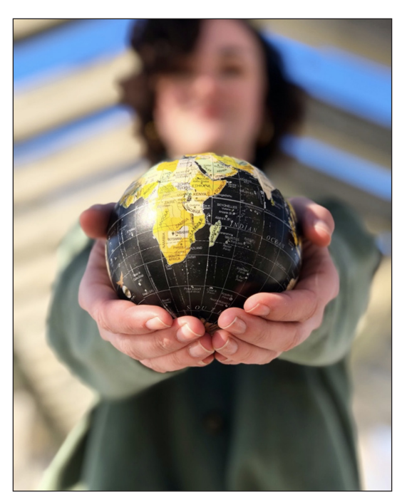
Figure 1. Image<sup>3</sup> similar to the one used by student teacher D

This conception of AL teaching coincides with what student D describes: