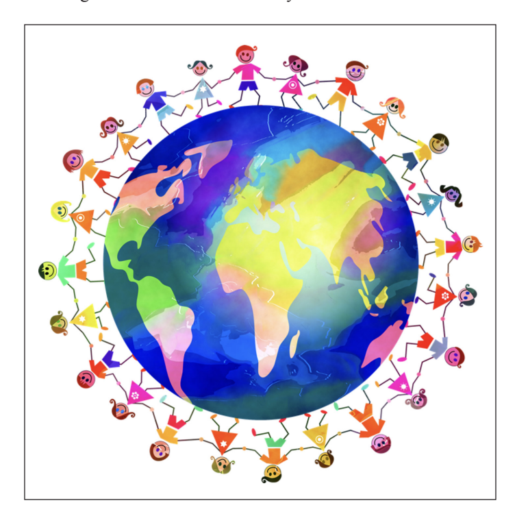
Figure 2. Image<sup>4</sup> similar to the one used by student teacher G

The three images in this category represent children from different ethnicities in a circle holding hands (see example in Figure 2).