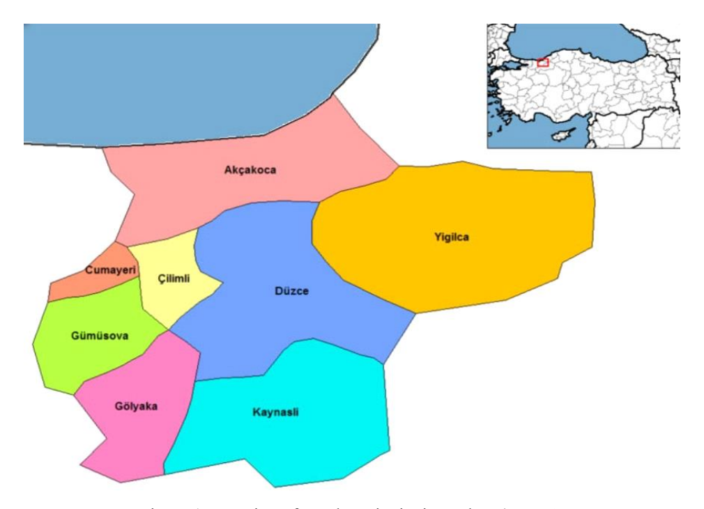
Figure 1. Location of Yığılca District in Turkey (URL-1)

The study area covers the Western Black Sea Region Düzce province Yığılca district. Yığılca District, which is between Düzce, Bolu and Zonguldak provinces, is the Alaplı district of Zonguldak province from the north; it is surrounded by the Mengen district of Bolu province from the east. It is located in the northeast of Düzce Province, in the northwest of Bolu Province, in the southwest of Zonguldak, in the northeast of Kaynaşlı district and in the southeast of Akçakoca district. It is also 35 km away from Yedigöller National Park, which is one of the important tourism centers of our country (see Figure 1).