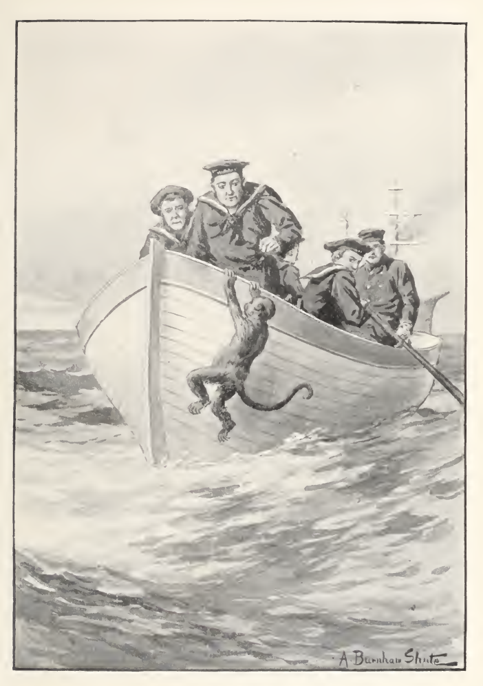
She made a vigorous leap into the fore-sheets. {\it Page~267}.