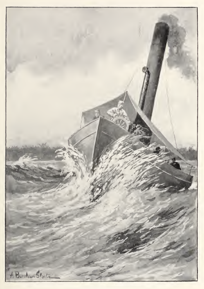
The boat rose gracefully on the billows, {\it Page~132},