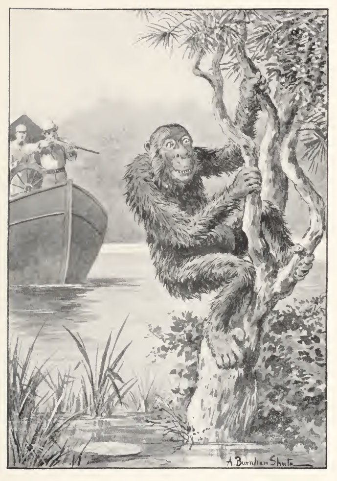
"You are near enough, Captain."