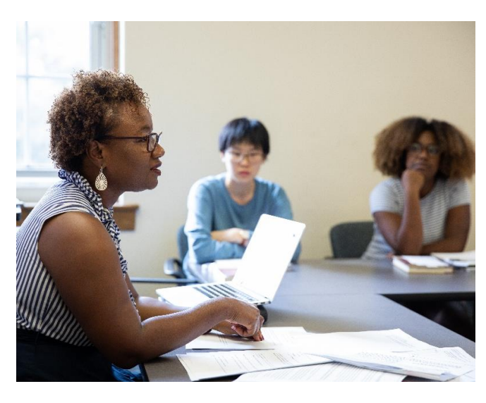
College of the Holy Cross

U.S. percentages are from the 2021 U.S. Bureau of Labor Statistics Occupational Employment Statistics and are based on faculty at U.S. postsecondary institutions that award bachelor's degrees.