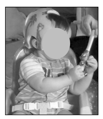
Figure 1. One child participating in the reaching assessment.

Children were assessed longitudinally at the baseline visit, and 1.5, 3, 6, 12 months postbaseline in their home environment by a trained researcher blind to the child's treatment group assignment. At each visit, children were assessed with an established reaching assessment (Babik et al., 2019); at each visit, except at 1.5 months, children were also tested on the Bayley-III fine and gross motor subscales. For the reaching assessment, children were tested while sitting in a booster seat that provided trunk support and interacting with a target object (easily graspable toy about 6 \times 2 ") presented across five, 20-sec trials at the following locations within the child's reach (Figure 1): (1) midline at the child's hip level; (2) midline at the child's chest level; (3) midline at the child's eye level; (4) chest level on the child's right side; and (5) chest level on the child's left side. For the purpose of the current analyses, data were aggregated among locations to provide a global picture of reaching